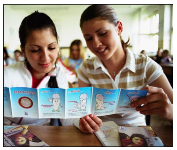
High school students in Bucharest, Romania, examine a condom advice leaflet and other contraceptive educational materials during a talk on sexual health. Peter Barker (Panos Pictures), 2006

Unsafe abortion carried out by individuals lacking the necessary skills and/or in unhygienic conditions, is a major global public health problem. The practice occurs where abortion is legally restricted, and where access to safe services is inadequate although the law may broadly permit the procedure. Unsafe abortion causes death and ill health in women, and